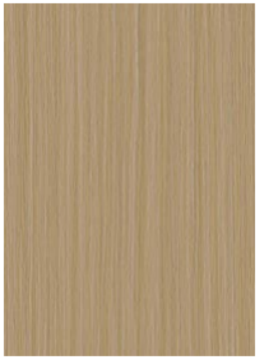
218 Ev Raw Oak NEW