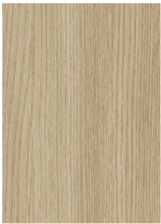
46 Natural Oak