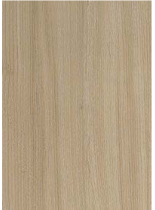
239 Latvian Elm NEW